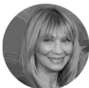
Maureen Van Zandt Artistic Achievement Award