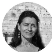
Mil Wexler Community Service Award