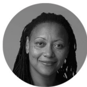
Fredi Walker-Browne Artistic Achievement Award