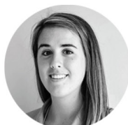
Morgan Sackman Business Leadership Award