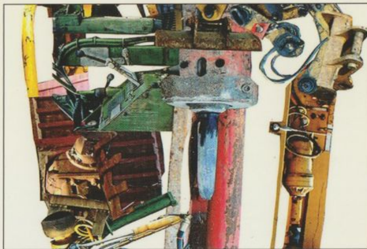
Image Credits (clockwise from right): Oreen Cohen, detail of Running Drill , photo collage sketch, 2011; Sean Lundgren, detail of Nave , mason line, wood, hardware, dimensions variable, 2011; Lindsay Rowinski, three median curbs , archival inkjet print, 16 X 24 inches, 2011.

Oreen Cohen | Lindsay Rowinski | Sean Lundgren