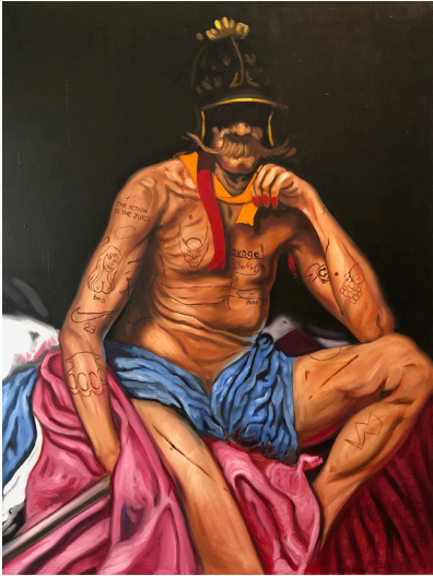
God of War (After Velasquez)